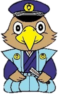
Ishikawa Prefectural Police Mascot—Inuwashi-Kun